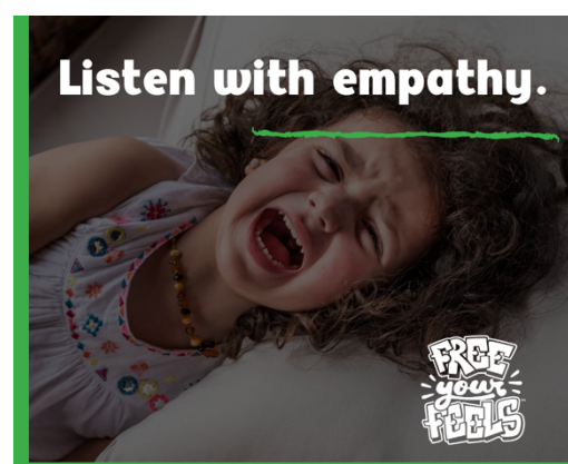
Sample caption for graphic 2:

Little kids have BIG feelings. Tantrums and defiance are a normal part of a toddler's social-emotional development. Set limits but always listen so the child knows they're safe to express their feelings with you. #freeyourfeels Find more resources at www.freeyourfeels.org .