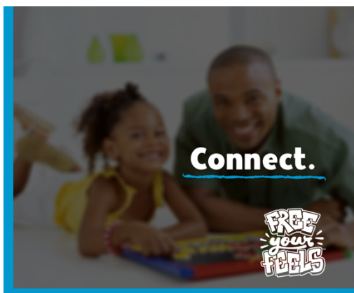
Sample caption for graphic 1:

Be a responsive caregiver to the youngest in your care. Provide them the space to express their feelings without getting into trouble. #freeyourfeels Register for DECAL's Infant Toddler Webinar series to learn more! https://tinyurl.com/DECALInfantWebinar