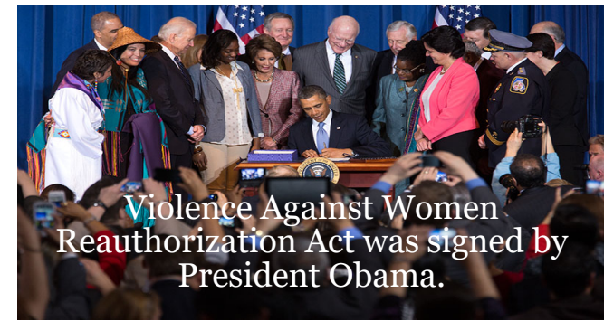
Violence Against Women Reauthorization Act was signed by President Obama.